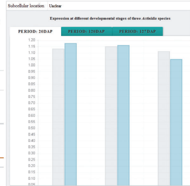
Figure 2. Screenshot of the detailed information of putative proteins, including basic information, functional description, biological pathway, molecular structure, predicted PPI, protein expression and related publications.

chromosome sequences are provided in Generic Feature Format 3 (GFF3) format, along with FASTA files of each chromosome sequence. Lists of data files for previous genome release are also available on the ftp site. In contrast to the ftp site that provided genome-wide datasets, a variety of gene functional description, transcriptome data and protein annotation files are provided in the form of flat-files. All data are hosted and accessible publicly. Users can also